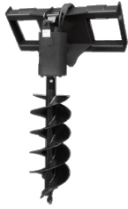
Heavy Duty Auger Drive