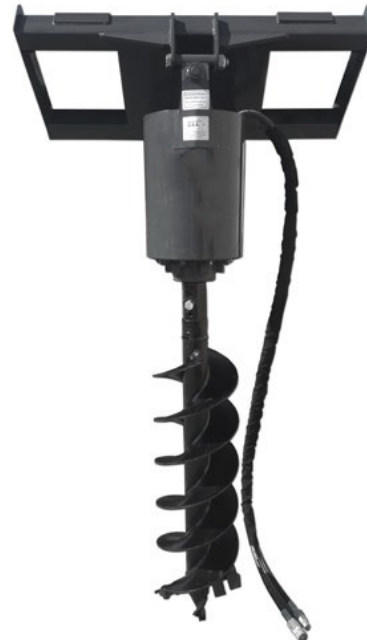
X-treme Auger Drive