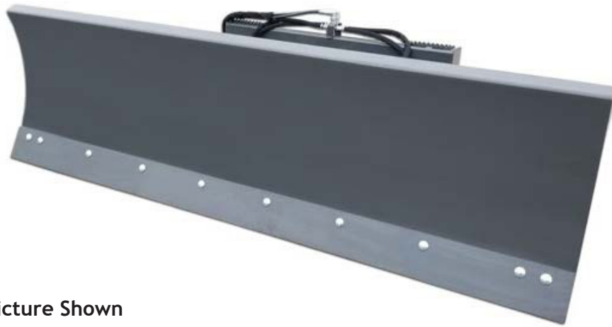
6-Way Picture Shown